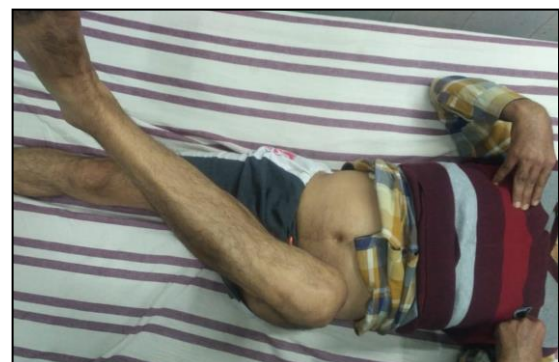
Figure 3: External rotation at final follow up.