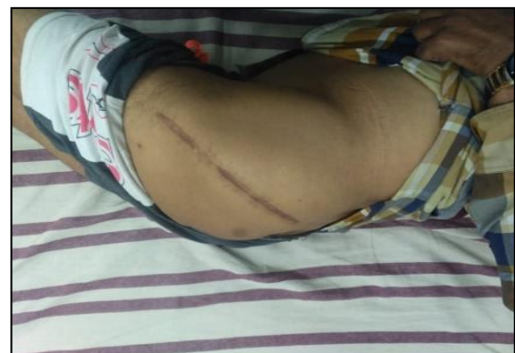
Figure 2: Incision scar at final follow up.