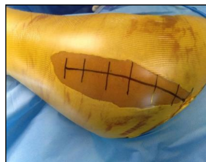
Figure 1: Draping and marking.

induced, 1 with renal transplant and one patient with chronic alcohol intake. Limb length discrepancy (LLD) was found postoperatively in 13 patients. All the patients with LLD had less than 1.5 cm of discrepancy. 2 patients were complicated with superficial surgical site infection, 3 with anterior thigh pain and 1 with trendelenburg gait. Most common head size used was 36 mm in 14 patients, 32 mm in 9 patients and 28 in 2 patients. 21 patients had central stem configuration with varus in 4 patients. Acetabular inclination range from 40 to 50 degrees in all patients. Mean pre-op Harris Hip Score (HHS) improved from 65.875 to 96.52 post-operatively. Noted improvements occurred in pain score from 26 in the pre-op group to 43.04 in the post-op group. No dislocations were reported in our study and no cases of heterotopic ossification were reported.