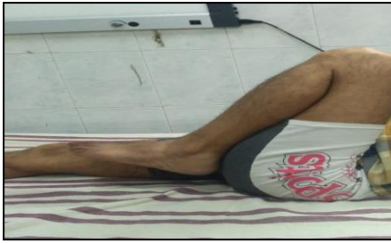
Figure 4: Flexion at final follow-up.