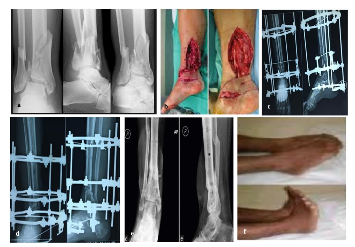
Figure 3: Case illustration of type IIIB both bone leg fracture treated with Ilizraov fixator; (a) the initial X ray, (b) soft tissue condition, (c) immediate post op following Ilizarov ring application, (d) follow up at 18 weeks showing evidence of union, (e) bony union and alignment after removal of Ilizarov and (f) skin condition and ankle movements after removal.

surgeon expertise are the key determinants in the outcome of such injuries.<sup>5</sup> Previously, immobilisation and casting was considered as the first line of management in such fractures. However, with the current options available, many surgeons have moved on to fixation with plates and screws, the use of intramedullary nails and external fixators.<sup>5,9</sup> Prompt evaluation of the open fracture, tissue debridement under sterile conditions, initiation of appropriate antibiotic cover and fixation of fracture are the key dictums which remain unchanged in the management.<sup>10,11</sup> Plate fixation is associated with a number of complications, especially in comminuted fractures. Allan et al reported osteomyelitis in 19% of open tibial fractures treated with plate fixation.<sup>12</sup> In recent years primary intramedullary nailing is gaining wide acceptance for the treatment of open tibial fractures in developed countries.13 Nevertheless intramedullary devices are associated with problems of infections and delayed unions. External fixators have become the go-to alternative because of relative ease of the procedure and the limited disruption of the blood supply of the tibia. However, these advantages are potentially outweighed by the high incidence of pin-tract infections, non unions, difficulties relating to soft-tissue management and risk of malunion.