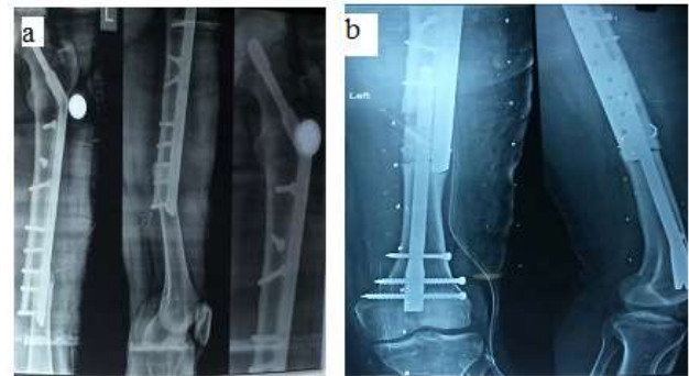
Figure 6a & 6b: Implant failure treated with retrograde nailing successfully.

annual meeting of the Orthopaedic Trauma Association, two prospective studies on retrograde femoral nailing were presented.