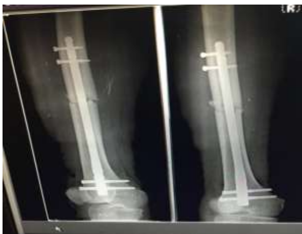
Figure 2: Surgical stabilization retrograde nailing. Postoperative radiographs of a distal third femoral shaft fracture treated with a retrograde interlocking nailing.

Retrograde nailing have an advantage over other techniques, viz