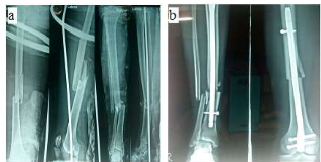
Figure 3a & 3b: Floating knee injury stabilised by retrograde nail and tibia interlocking nail using single incision over patellar tendon.

Lonnel et al described the use of retrograde nail in a patient with ankylosed hip and stiffed knee with prior history of head injury. 19 The patient had heterotopic ossification around hip and sustained a femoral shaft fracture after a fall. The presence of heterotopic ossification in the hip region pre-operatively made an antegrade starting portal almost impossible. The authors proceeded with retrograde femoral nailing and obtained good results.