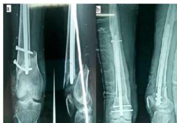
Figure 4a & 4b: Fracture from the tip of antegrade nail treated with retrograde nail.