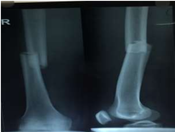
Figure 1: X-ray showed traumatic fracture at distal femur.

Intramedullary femoral nailing has classically been performed using antegrade entry from piriformis fossa and has produced excellent results. Winquist et al had 99.1% union rate with postoperative knee ROM averaging 130 degree and 0.9% infection rate. 7 Since antegrade nail has been so successful there has been resistance in surgeons to accept retrograde nailing as an alternative as shown in Figure 1 and 2. 8