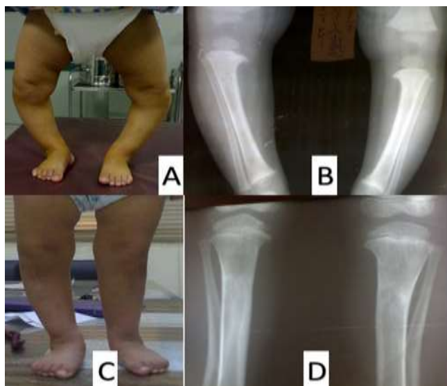
Figure 5: Female patient 3.5 years old with bilateral genu varum due to infantile tibia vara. A&B: preoperative clinical and X-ray appearance; C) postoperative photo at the end of follow up; D) 1 year postoperative X-ray with full correction in left and residual 15 degrees varus in right side.

In one case there were under-correction of deformity by (15 degrees varus) but, it was accepted by parents of the girl, so reoperation was not needed.