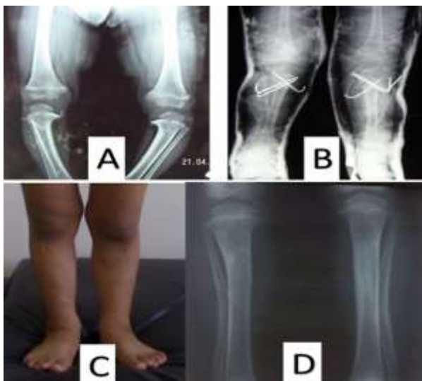
Figure 3: Operative technique A) preoperative x-ray of left leg in 4.5 years female, B) exposure of proximal tibia and pre-drilling for osteotomy; C & D) percutaneous K-wires for fixation; E) postoperative X-ray in cast.

Intra-operative corrections of the deformity was assessed clinically and radio-graphically using a diathermy cord passing from the center of the hip to the center of the ankle joint to identify the mechanical and anatomical axes. The osteotomy was stabilized with crossed 1.6 or 2 mm Kirschner wires inserted percutaneously. During wound closure, care was taken to preserve the periosteum and the soft tissues. All wounds were sutured using an absorbable subcuticular stitch. An above-knee plaster cast was applied. At 2 weeks, the plaster cast was changed under general anesthesia and the final position of the osteotomy adjusted, in three legs (8.2%), according to the mal-alignment detected on the follow up radiographs, and the K-wires were loose in one osteotomy, stable in two, so, K-wires were resited under image intensifier. The K-wires were removed at 6 weeks without a general anesthetic. The plaster cast was removed when the osteotomy was united clinically and radio-graphically. The total time in cast varied with the age of the patient. Full weight bearing was allowed at 6 weeks. Physiotherapy was commenced following cast removal.