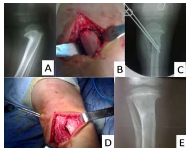
Figure 4: Female patient 3.5 years old with bilateral tibia vara: A) X-ray preoperative deformity; B) postoperative plain X-ray; C) photo of the patient 30 months after osteotomy with corrected deformity; D) X-ray 1 year postoperatively.

Two weeks postoperative during change of plaster, two limbs showed some loss of angular correction and K-wires were extracted and resited percutaneously after manipulation under anesthesia with application of a valgus force to correct the residual deformity. The total time in plaster varied with the age of the patient. All osteotomies united within time ranged from 2 to 4 months. At a mean time of 30-months of follow-up, all patients had a good clinical and radiological correction of deformity with improvement of preoperative symptoms as given in Figure 4 and 5.