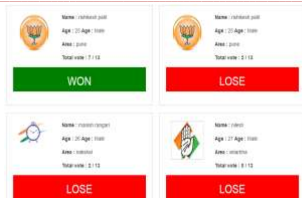
Fig 6: Vote Counting Result