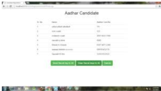
Fig 4: Candidate List

the clients in the network. Database is maintained in server computer and all the main codes related to our project is stored in this server computer. For storing database, MySQL database is used. Both Android system and the server are linked to the same MySQL database in order to the voter can vote through only one time and if he/she tries to vote again the system will deny him/her.