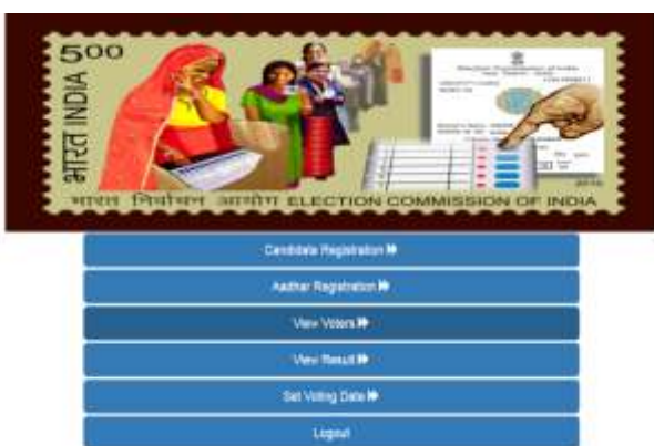
Fig 5: Admin Panel

Information provided by administration about voters system successfully utilized in voting. Portable facility will be the key factor of this system. Our system has increased accuracy and consistency.