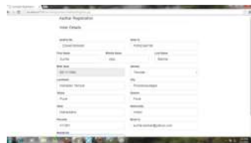
Fig 3: Registration form

Registration Activity: Administrator is responsible for storing the information of the new voter modify any voter's information, updating and also some operations related to candidate information. EC is the election committee that will generate the report and also declare the voting results.