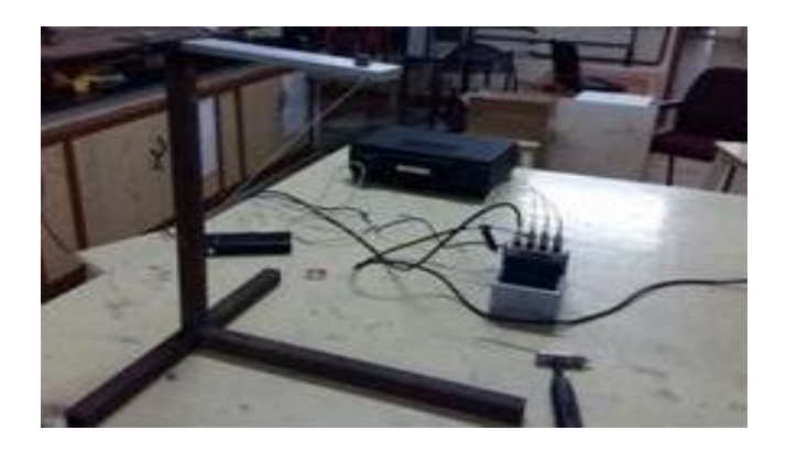
Fig3: Experimental setup for cantilever beam

The experimental setup for the experimental analysis is shown in the fig5. Table 5 shows the experimental results for two materials