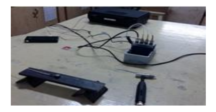
Fig2: Experimental setup for simply supported beam