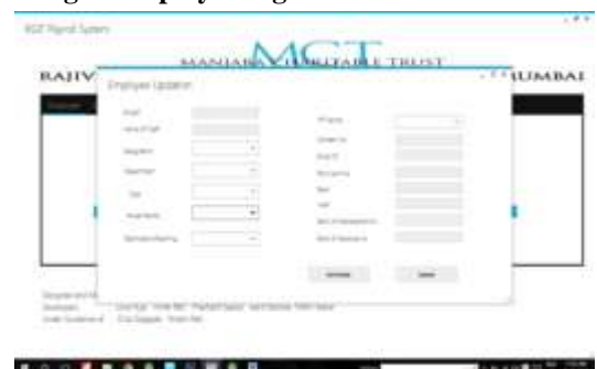
Fig. 3 Employee detail updation