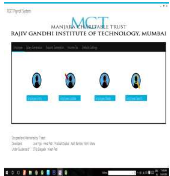
Fig. 1Home Screen