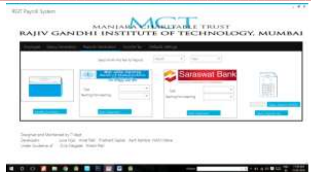
Fig.7 Report Generation