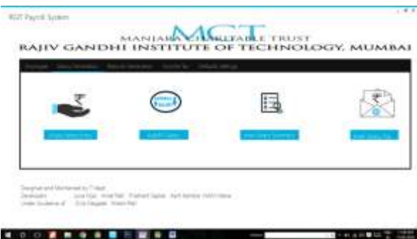
Fig.6 Salary Generation