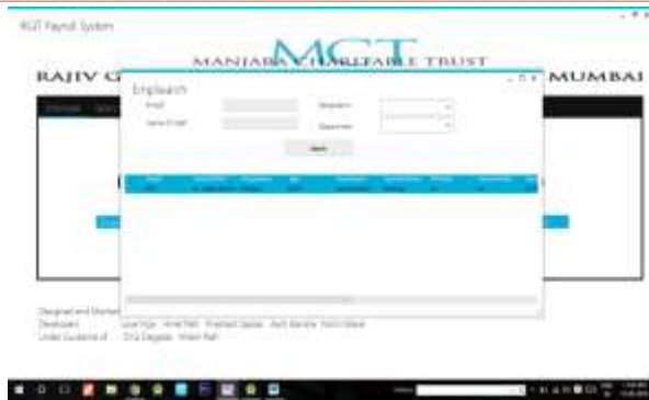
Fig. 4 Employee search