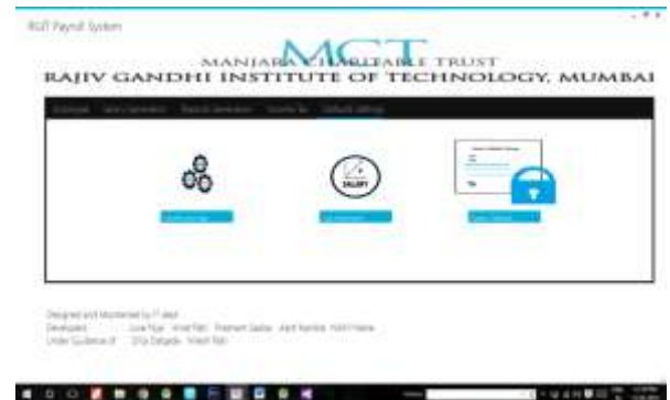
Fig.9 Default settings