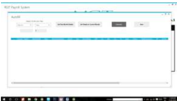
Fig. 5 Autofill salary