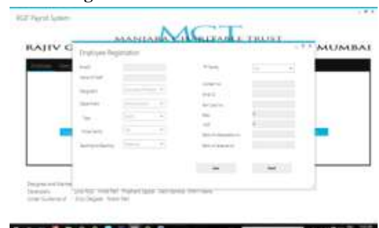
Fig. 2 Employee registration