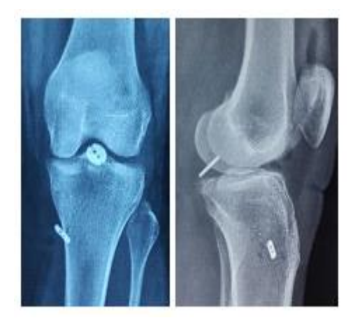
Figure 6: Post-operative X-rays shows anatomical reduction of the avulsion fracture.

ABS button is guided through the low PM portal. The Tightrope is cinched from anteriorly to till the ABS button sits over the avulsed PCL fragment. Anterior drawer is applied while cinching.