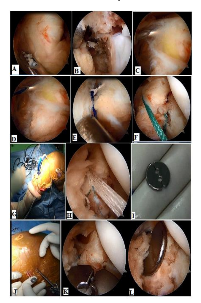
Figure 5: Intraoperative views.

High posteromedial portal is used for visualization and low posteromedial portal and anteromedial portal are used as working portals. 8.5 mm cannula is used in low posteromedial portal. PCL avulsion from its tibial attachment is noted and will be displaced superiorly and medially. Fracture base is debrided with shaver and fracture reduction is checked with probe.