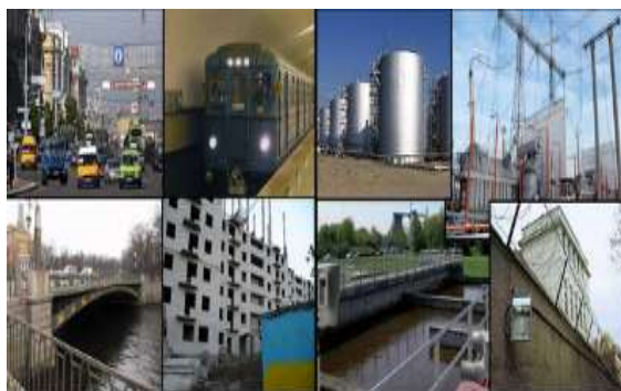
Figure 1 . Applications of camera surveillance systems

Public security has become very important issue due to the increased terrorist attacks, burglaries etc. Electronic surveillance forms an integral part of today's security systems. CCTV modules are sold in huge numbers across the globe. Primitive surveillance systems [1] involved cameras. All these cameras would feed the live video to a dedicated monitor and in a control room many such monitors would be stacked one upon the other. These systems can be found in departmental stores, museum to high security areas like railway stations, airports and banks.