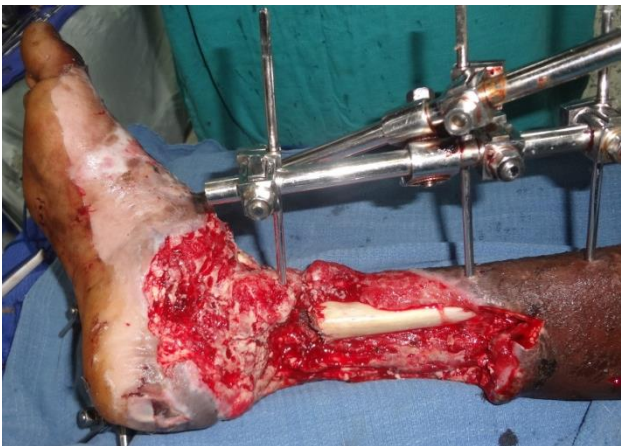
Figure 5a: Post traumatic composite defect lower 1/3 right leg.