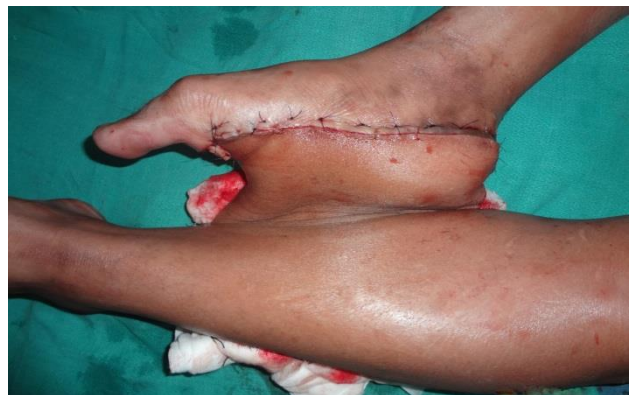
Figure 4d: After flap inset.