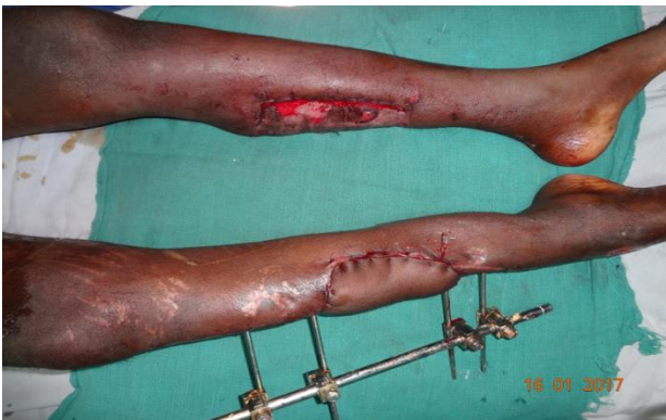
Figure 3d: After flap division and inset, POD-21.