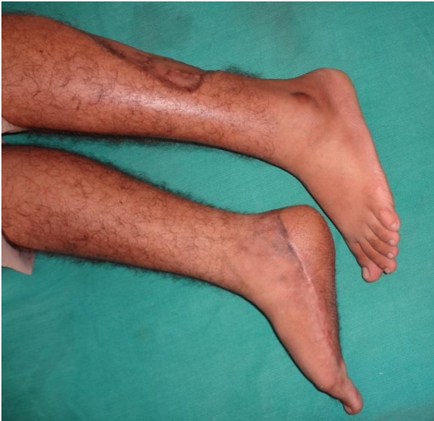
Figure 4f: 3 months post-operative period showing well healed flap.