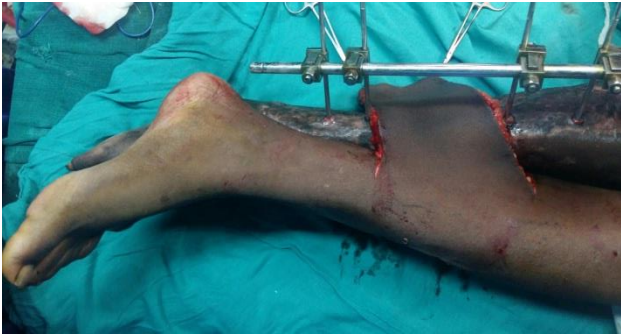
Figure 3b: Limbs placed in the position for inset.