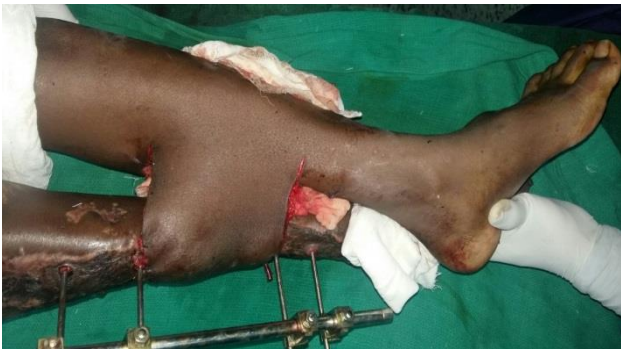
Figure 3c: After flap inset.