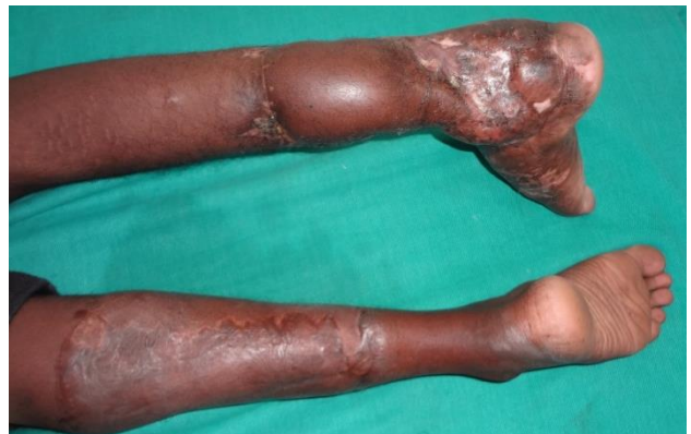
Figure 5d: 1 year follow up showing well healed flap and donor site.