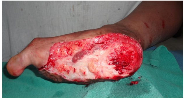
Figure 4b: After excision of the unstable scar.