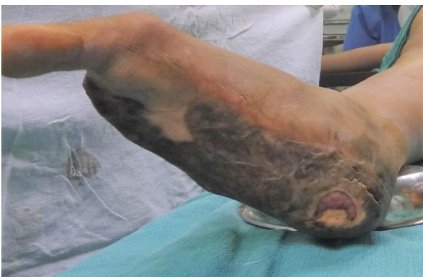
Figure 4a: 30/M post traumatic post-surgical unstable scar right sole of foot.