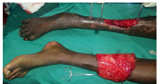
Figure 3a: Post traumatic soft tissue defect upper and mid 1/3 right leg, wound debridement done, medially based cross leg flap elevated.