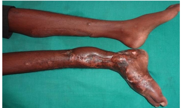
Figure 5c: After flap division.