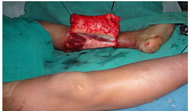
Figure 4c: Medially based cross leg flap elevated beyond the posterior midline.