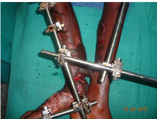
Figure 5b: Reverse superficial sural artery flap from left leg for covering the exposed tibia.