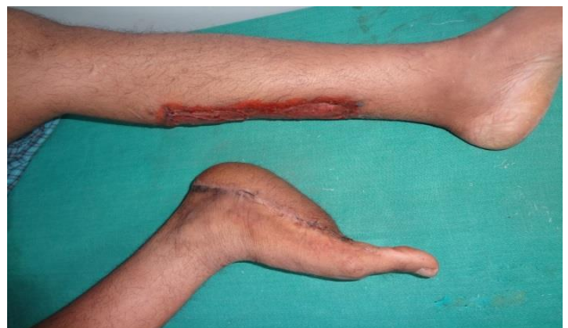
Figure 4e: After flap division, donor site healed well.