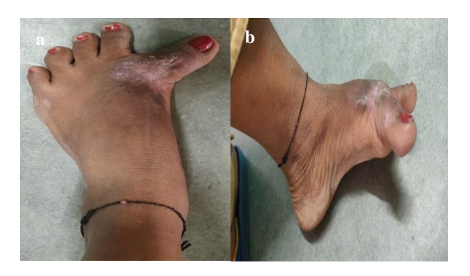
Figure 1 (a and b): Clinical picture of foot showing healed chronic sinus in dorsal aspect of the base of great toe with varus deformity.

was done; foot X-ray (Figure 3) showed disease around the MTP joint of great toe with varus deformity. In the X-ray of the hand (Figure 4) there was bony destruction of the distal end of first metacarpal and pathological dislocation of the 1st MCP joint of left hand.