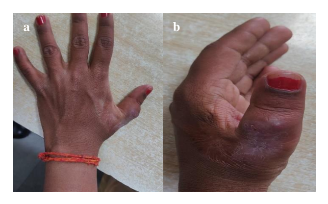
Figure 2 (a and b): Clinical picture of the hand showing signs of active infection of the base of thumb.