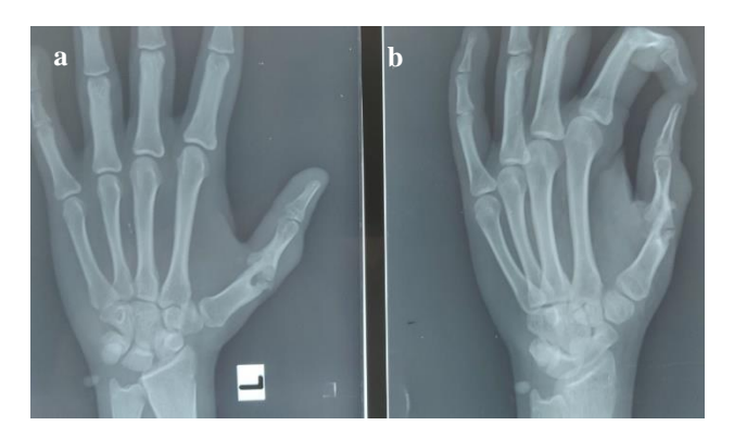
Figure 4 (a and b): X-ray of the hand showing lytic lesion and destruction of distal end of 1st metacarpal with pathological dislocation of MCP joint.

patient was started on 4 drug regimens of antitubercular therapy consisting of rifampicin, isoniazid, ethambutol and pyrazinamide respectively.