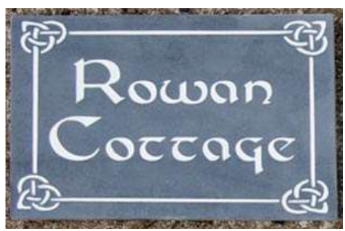
Fig 2. Name Plate

We can obtain the image and after that, various methods of processing can be practiced to the image to perform the many different vision tasks required today [3].