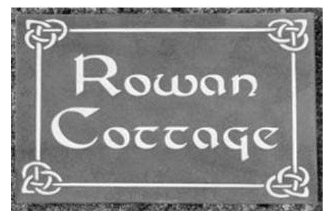
Fig. 3 Gray Scale conversion

In this paper the algorithm described is not depend on the type of colours in image and confide mainly on the gray level of an image for processing and extracting the required information. Colour components like Red, Green and Blue value are not used throughout this algorithm. So, if the input image is a colored image represented by 3-dimensional array in MATLAB, it is converted [4].