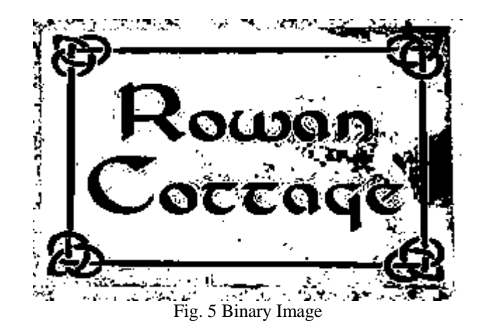
Image is converted into binary image from gray scale. Intensity change value is calculated easily as compared to gray scale and color image.

In a binary image, each pixel assumes only one of the two discrete values: 1 or 0. A binary image is stored as a logical array. An image consists of numeric values between 0 - 255. The numerical value of the picture is reduced to two values with binary level. Thus, an 8 - bit image is converted into 2 - bit format. The threshold value must be determined for this conversion. If the pixel value in the image is greater than threshold value, then the pixel value is shown as "0"; and if the image pixel' value is less than threshold value, the pixel value is shown as "1". In this way the image is converted to the binary level [6].