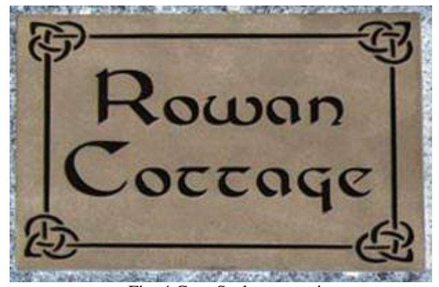
Fig. 4 Gray Scale conversion