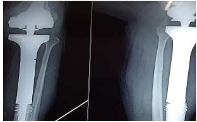
Figure 6: Follow-up at 8 months with no evidence of recurrence and good position of implant.