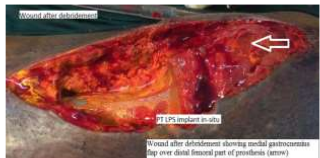
Figure 2: Post-debridement with arrow showing medial gastrocnemius muscle flap.