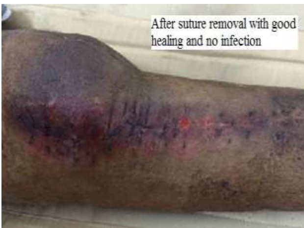
Figure 5: Following delayed suture removal.