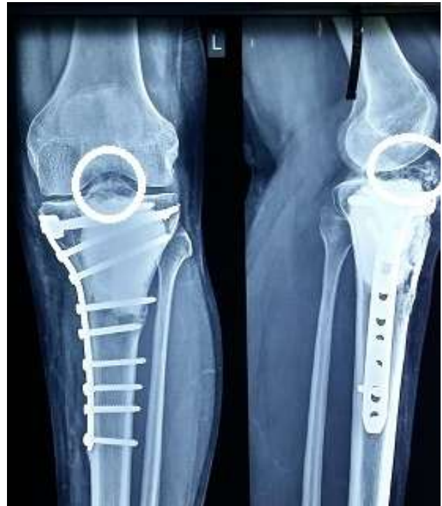
Figure 1: Preoperative X-ray showing recurrence of chondrosarcoma (encircled).

was delayed till 18-21 days. Antibiotics were continued for a period of 6 weeks.