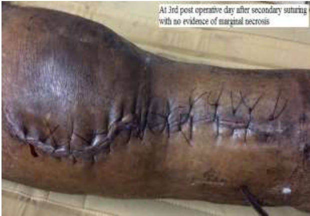
Figure 4: Following secondary suturing.