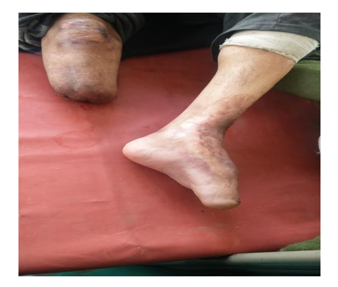
Figure 3: A case of combined below knee amputation and forefoot amputation.

A case of young boy with below knee amputation secondary to fire arm injury, developed depression post operatively. Patient was counseled as per protocol and below knee prosthesis was fitted and patient was mobilized again with smile on his face (Figure 2).