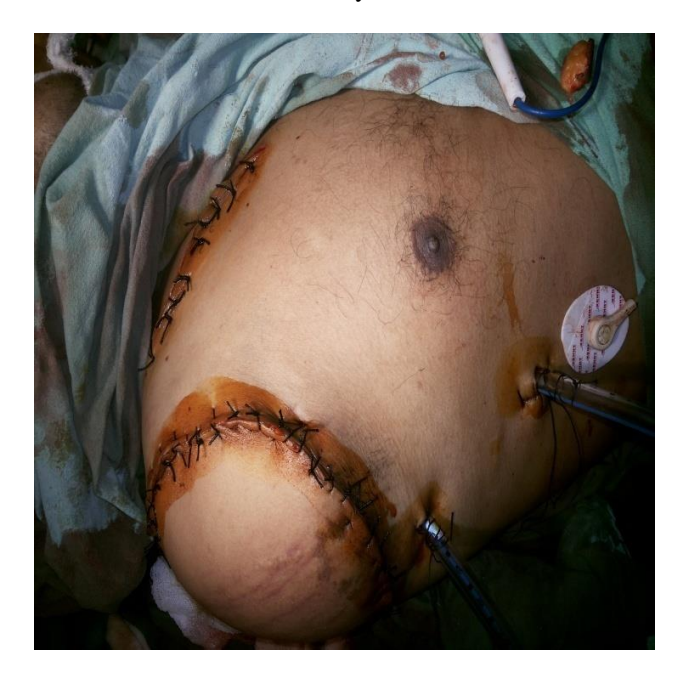
Figure 4: Case of shoulder disarticulation.

Young male suffered electric burn resulting in severe damage to right leg and left foot. Patient was managed with below knee amputation on right side and forefoot amputation on left side. Post operatively patient developed depression and was managed as per protocol with satisfactory results. Patient was ambulated with the help of prosthesis after 3 months of surgery (Figure 3). Patient was also provided with a suitable job as he was sole bread earner for his family.