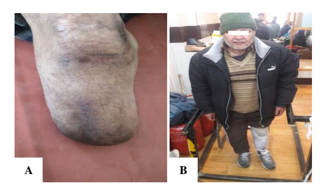
Figure 1 (a and b): A case of 60 year old male underwent below knee amputation on left side.

Mean age in our study among males was 38 and mean age in females was 47 (Table 4).