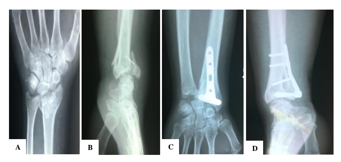
Figure 3: (A, B) Preoperative X-ray; (C, D) postoperative X-ray.