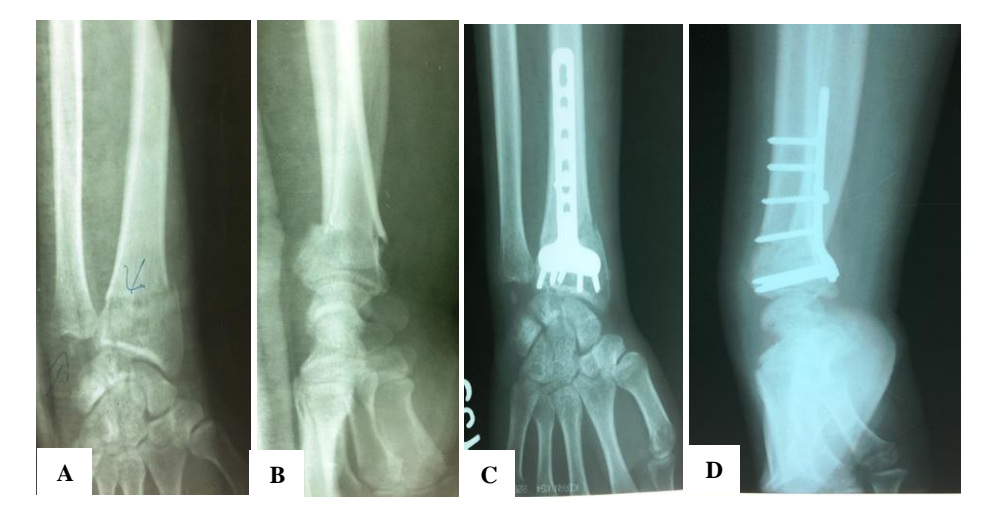
Figure 1: (A, B) Preoperative X-ray; (C, D) postoperative X-ray.

At the final follow up, 7 patients with type 23A2 fracture had a mean Mayo wrist score of 93.5 and 6 out of these 7 patients had an excellent outcome while 1 patient had Good outcome. 6 patients with type 23C1 had a mean Mayo wrist score of 87.5 and all these 6 patients had a good outcome. 3 patients with type 23A3 fracture had a mean Mayo Wrist Score of 86.6 and all these 3 patients had a good outcome. 1 patient with type 23C3 fracture had Mayo wrist score of 55 and a poor outcome. 8 patients with remaining fracture types of 23B2, 23B3 and 23C2 had satisfactory outcome with mean Mayo wrist score being 69.3 (Table 2).