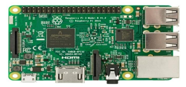
Fig. 2: Raspberry Pi 3

1) Raspberry-Pi 3: The Raspberry Pi is nothing but a series of small single-board computers developed by Raspberry Pi Foundation of United Kingdom to provide low cost solution for teaching of basic computer science in schools and in developing countries. The processor used in Raspberry Pi 3is a Broadcom BCM2837 SoC with a 1.6 GHz 64-bit quad-core ARM Cortex-A53 processor, with 512 KB L2 cache. It has potentially fast enough to decode H.265-encoded videos in software. The GPU in the Raspberry Pi 3 runs at higher clock frequencies of 300 MHz or 400 MHz than previous versions which run at 250 MHz The Raspberry Pi primarily uses Raspbian, a Debian-based Linux operating system. Raspberry Pi 3 has the functions over other models of Raspberry Pi such as