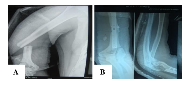
Figure 1 (A and B): Fracture of the shaft humerus treated with dynamic compression plate (DCP).

months. The radiograph showed nonunion of the fracture (Figure 3A), for which he was operated again by Implant extraction and ORIF using DCP humerus and autologous cancellous bone graft (Figure 3B).