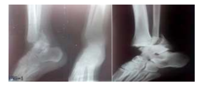
Figure 3: Showing the "dime sign", the broken ball.