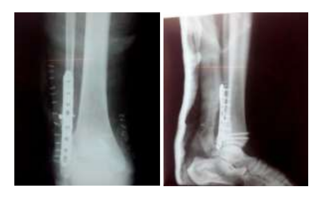
Figure 5: Showing anteroposterior and lateral radiographs of management of case in Figure 2.

All the cases were given a post-operative plaster of Paris slab for 4 weeks and suture removal was done on 14<sup>th</sup> postoperative day. 4 patients had wound dehiscence, they were managed by secondary suturing, none had surgical site infection (SSI).