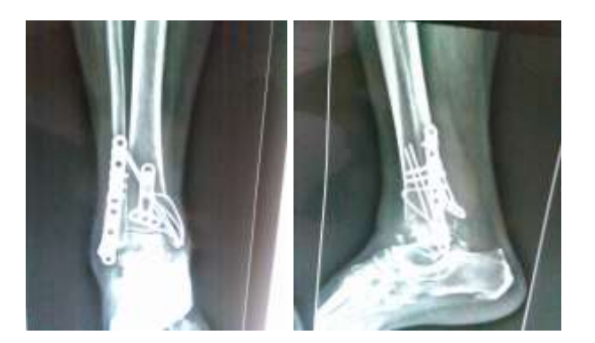
Figure 7: Radiographs showing management of another case of trimalleolar fracture with buttress plate fixation of posterior malleolus and anatomical plate for lateral malleolus.