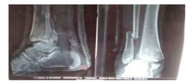
Figure 4: Showing increased medial clear space, indicating lateral shift of talus.

The "ball" or "dime sign" is described on the AP view as an unbroken curve connecting the recess in the distal tip of the fibula and the lateral process of the talus when the fibula is out to length (Figure 3). Any deviations from the 'normal' in the talocrural angle or the dime/ball sign is an indication of subluxation or instability. The lateral view radiograph is also used to assess the posterior malleolar fragment size vis-a-vis tibial plafond (Figure 2A). An asymmetry of the articulation between the talus and the tibia and fibula on the mortise film, represented by differences in measurements of the medial, superior, and lateral clear spaces indicated ankle instability and subluxation. The distance between the lateral border of the medial malleolus and the medial border of the talus (the medial clear space) should be equal to the superior clear space between the talus and the distal tibia. A space greater than 4 mm is considered abnormal and indicates a lateral shift of the talus (Figure 4).