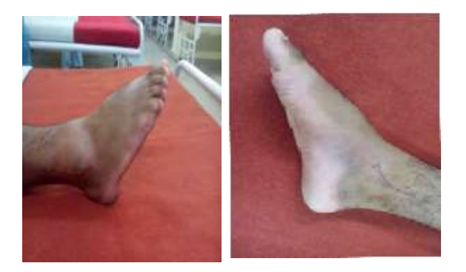
Figure 8: Shows postoperative range of movement.

All the patients were examined at 6 weekly intervals for an average of 28 weeks. At every visit radiographs of the operative site were taken. Anteroposterior (AP), lateral and mortise views were taken. They were observed for bony union, maintenance of the ankle mortise, any subluxation/lateral shift of talus, implant position, arthrosis and integrity of syndesmosis. While radiologically bony union took an average 6.4 months, none of the patient had any signs of talar shift or arthroses and integrity of the syndesmosis was well maintained throughout the follow up period in all the cases. Clinical examination included observations for any local swelling, regional tenderness, joint laxity and range of movement at ankle joint. The average dorsiflexion was 10° and plantarflexion was 35° at an average 12 weeks follow up (Figure 8). None of the patients had laxity of ankle joint tested by drawer test. We used the scoring system for ankle fracture developed by Olerud and Molander.<sup>19</sup> Clinically the patients were rated out of a maximum of 100 points. They were given a set of questionnaire at every visit based on the scoring system and accordingly evaluated. We noted that 19 patients had excellent outcome (score>92), 4 had good (87-91) and 2 had fair outcome (65-86).