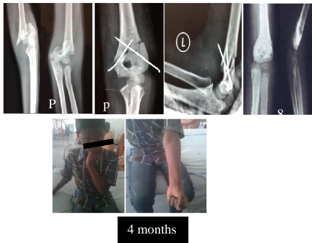
Figure 2: X-ray and clinical pictures of case 2.