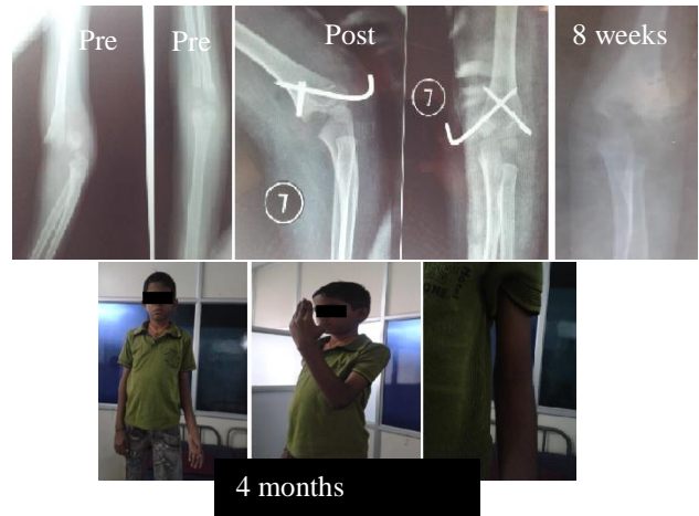
Figure 4: X-ray and clinical pictures of case 4.

assessments were associated with radiographs (Figures 2-4).