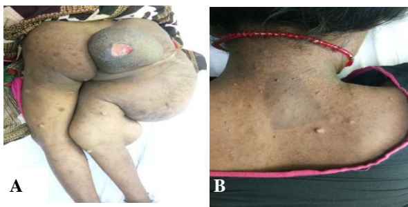
Figure 1: A) A large plexiform neurofibroma involving right thigh, B) Cafe-au-lait.

On examination a large mass of size 60×30×25 cm was present on the posterior aspect of the right thigh extending from hip joint to upper end of popliteal fossa, with a smooth surface and defined margin (Figure 1). Tumour was mobile and pinchable with engorged venous prominence over the surface. Hip joint movement was hampered due to large mass and involvement of hip joint capsule. More than six cafe au lait spots are present of size more than 15mm, multiple subcutaneous neurofibroma was present. Adjacent to index tumour another tumour of size 20×20 cm was present near sacrum region with ulceration, and another tumour of size 15×15 cm was involving the right knee. Remaining systemic examination was essentially normal.