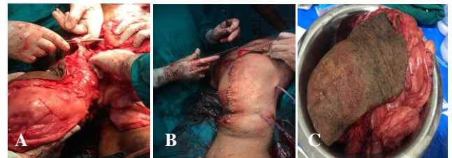
Figure 4: A) Entrapped sciatic nerve, B) closure of the wound, C) excised tumour mass.

Intraoperatively patient received 3 units of whole blood. In post-operative transient period of shock was present which was managed in intensive care unit and also by the transfusion of 3 units of whole blood. Patient was discharged after 5 days and stitch out done on the post-operative day 14 (Figure 5). Pathological examination revealed a plexiform and diffuse neurofibroma.