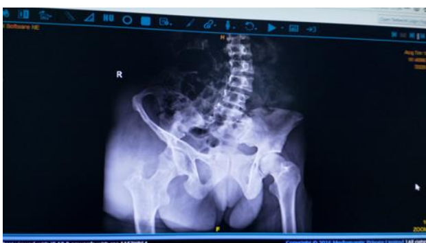
Figure 2: X-ray pelvis showing scoliosis with right iliac bone loss

X-ray pelvis revealed the scoliosis and iliac bone loss on right side (Figure 2). MRI impression suggested a heterogenous infiltrating mass in muscular and subcutaneous plane involving whole of the right thigh in posterolateral compartment, reaching up to gluteal region and right side of the pelvis with cortical irregularity of right femur and right sacral nerve entrapment in the lesion (Figure 3).