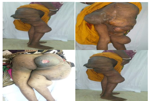
Figure 5: A) Post-operative day 14 after stitch removal, B) pre-operative image plexiform neurofibroma (posterior view), C) post-operative image after tumour resection (lateral view).

Intraoperatively patient received 3 units of whole blood. In post-operative transient period of shock was present which was managed in intensive care unit and also by the transfusion of 3 units of whole blood. Patient was discharged after 5 days and stitch out done on the post-operative day 14 (Figure 5). Pathological examination revealed a plexiform and diffuse neurofibroma.