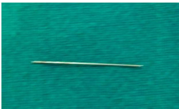
Figure 4: Removed broken needle.

An attempt was given for the surgical removal of broken needle in emergency operation theatre under local anaesthesia without the help of image intensifier but it failed. On the following day needle removal was done under spinal anaesthesia with the help of image intensifier. An incision was made at the injection site. Skin subcutaneous tissue was separated. A long artery forceps was used to locate the broken needle using image intensifier (Figure 2 and 3). Needle was found to be present deep within the muscle fibres of the gluteus maximus muscle. Needle was identified and removed (Figure 4). Wound was stitched in layers. Aseptic dressing done.