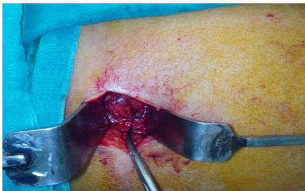
Figure 2: Incision over the skin marker site.

On examination of injection site mark, swelling and mild redness was present. Patient had a limp while walking and there was severe tenderness at the injection site. Routine blood investigations were done and x- rays of pelvis with both hips by applying radio opaque skin markers. On x- ray, the broken needle was identified and it was seen that it had migrated more posteriorly (Figure 1) from the injection site.