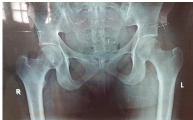
Figure 1: Broken part of needle in gluteal region posteriorly along skin marker pins.

practitioner, who confirmed her version of the narrative. After that the patient had severe pain in the injection site.