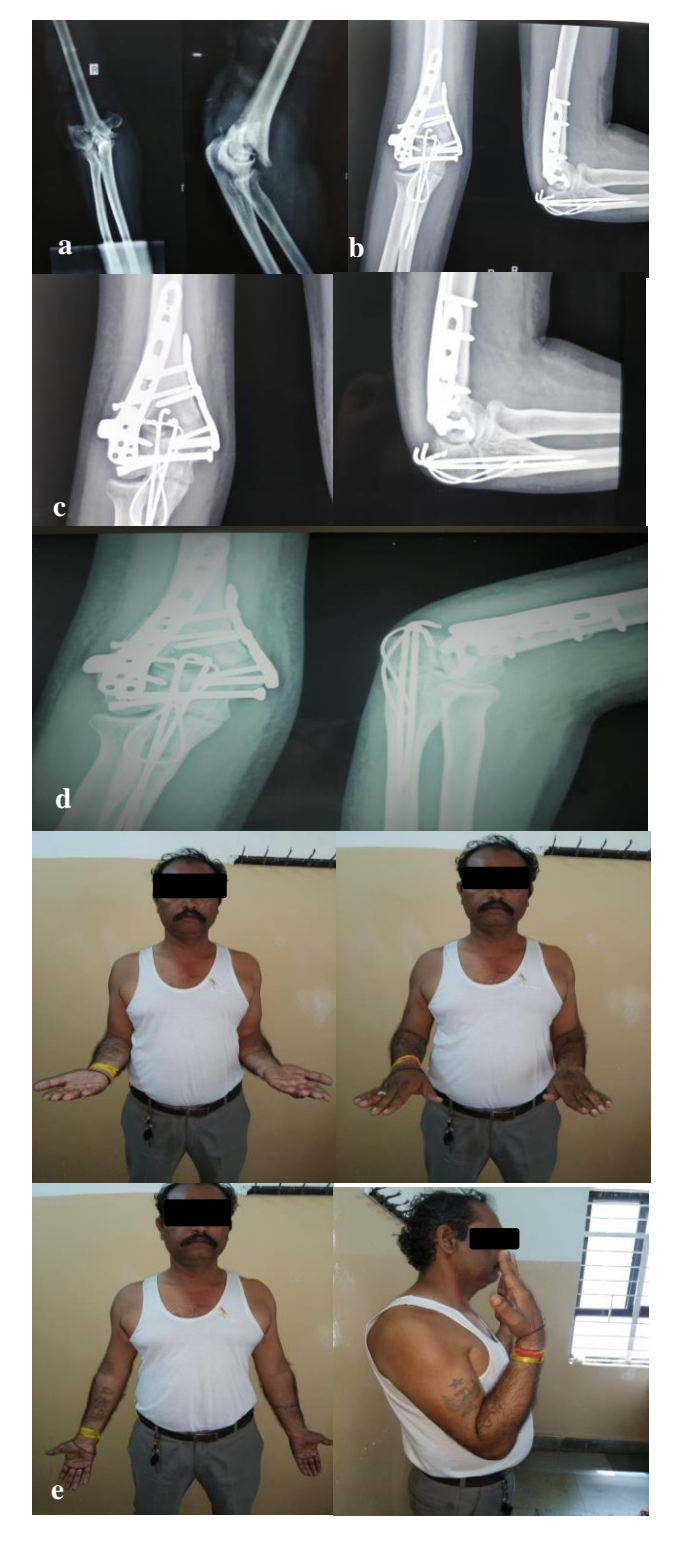
Figure 3: (a) Preoperative, (b) 6 weeks, (c) 3 months, (d) 6 months and (e) Range of motion 6 months postoperatively.