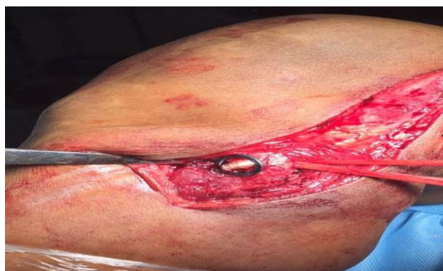
Figure 2: Graft fixation to fibula using titanium button.