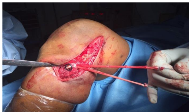
Figure 1: Graft fixation at fibular end is being done using titanium button.

Once the nerve has been isolated, a 1-cm longitudinal incision is made in the distal aspect of the long head of the biceps femoris tendon, along the fibers of the tendon to access the biceps bursa, where the FCL insertion can be found. 10 A mark was made with sterile pen on the distal end of the remnant FCL.