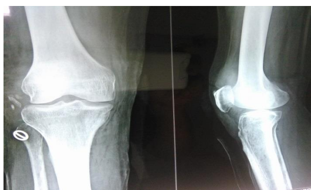
Figure 3: Postoperative X-ray titanium button is well seated at fibula head.

The anterior arm of the long head of the biceps femoris tendon is incised longitudinally, and the distal attachment of the FCL is sharply dissected to create room for the reconstruction tunnel on the fibular head. A guide pin is drilled from the FCL attachment on the lateral aspect of the fibular head (8.2 mm posterior to the anterior margin of the fibular head and 28.4 mm distal to the tip of the fibular styloid process, aimed at the posteromedial down slope of the fibular head, distal to the popliteofibular ligament attachment. 11 Aiming too proximally can damage the attachment of the popliteofibular ligament. A 6-mm reamer (Arthrex, Naples, FL) is used to create a