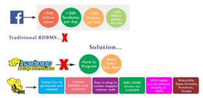
Figure 3.Evolution of Hive in FaceBook

The ability of SQL to suffice for most of the analytic requirements and the scalability of Hadoop gave birth to Apache Hive that allows performing SQL like queries on the data present in HDFS. Later, the Hive project was open sourced in August' 2008 by Facebook and is freely available as Apache Hive today.