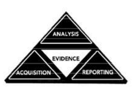
Fig. 1 Forensic analysis

Forensic analysis is the uses of documented and controlled analytical and investigative techniques to identity collect examines and preserve digital information. It is used to variety of data theft incidents. Some forensic analysis services are propriety Information theft reconstruction and analysis deleted data recovery and analysis. Digital forensics in a branch of forensic science encompassing the recovery and investigations of material found in digital devices often in relation to computer crime. Digital forensics investigations have a variety of applications. The most common is to support or refute a hypothesis before criminal or civil, courts; forensics may also feature in the private sector such as during internal corporate investigations or intrusion investigation. Issues of this digital forensics are obtaining magnetic residue data, dealing with an intrusion, looking into the logs, repairing the systems, tracking the hacker, keystroke loggers, finding the spy. Solution of this problem is admissible, authentic, and accurate, complete. Digital evidence has to be: Admissible is must conform to current legal buildings and could depend on legal system. Digital evidence has to be Authentic and reliability. Authenticate is most explicit link data to physical person. Must be self-sustained, strong access controls in place, logs and audit in good shape. Accurate means data process reliability determines content reliability and timings issues might throw you overboard.