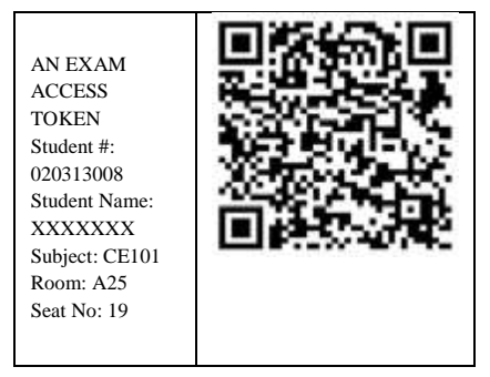
Fig.4 Diagram of QR Code

The Exam Server generates the QR-Code of the signed access string to get the exam access token as shown in diagram 4