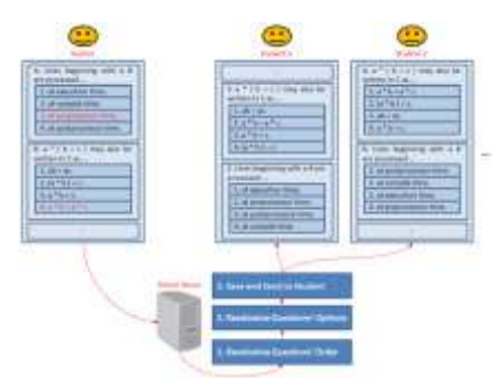
Fig .3 Diagram of random questions distribution

This service provides the following functionalities: Enabling the teacher to define a bank of exam questions and to link them to his/her subject via an appropriate interface. In case the objective kind of questions, each question may have a set of options. The teacher has to provide those options via the same interface and specify the correct choices among them to start the exam engine to auto evaluate students' answers. In case of optional kind of questions, a text box (or probably a sketching canvas) will appear below each question at the student android mobile device to allow him/her to write/draw the question's answer; those answers will be saved at server side. And it can be further reviewed and valuated by the teacher. In addition, each question will have a property to specify its diffrent "level" (let's say: A, B, C, D, and E).