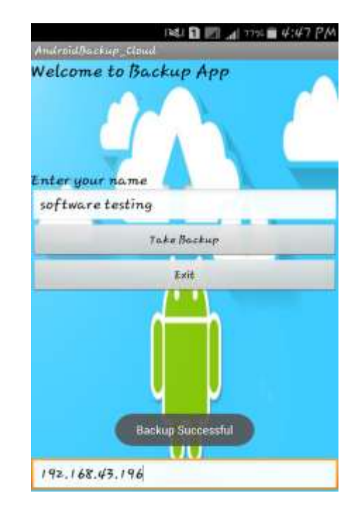
Fig 3. Backup Notification

4) After the backup successfully the all log files of the user data automatically sync with the cloud and admin can access this data anytime.