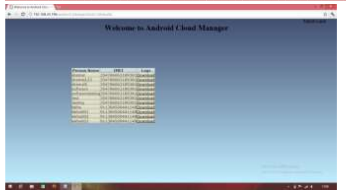
Fig 5. Registered user with cloud