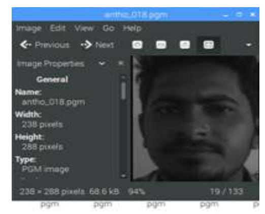
Fig. 2 Captured Database

As we chose bio-metric based system Enrollment of every individual is required. This database development phase consists of image capture of every individual and extracting the bio-metric aspect, in this case it is face, and later it is enhanced using pre-processing techniques and stored in the database. In our project we have taken the images of individuals in different angles, different expressions and also in different lighting conditions. A database of 50 individuals (MySQL-database) with 20 images of each has been collected for this project. Faces stored in the database shown in fig below.