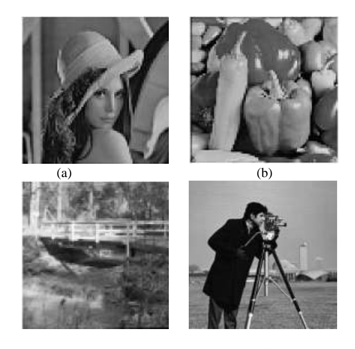
(c) (d) Figure 2 Standard test images for comparison of different filtering techniques. a)'Lena' b)'Peppers' c) 'Bridge' d) 'Cameraman'

Gaussian noise is an additive noise. The Gaussian noise is introduced on the image by adding random values to pixel values to produce a Gaussian distribution. As the SDROM filter uses twelve rank ordered differences and twelve thresholds, it can efficiently detect the presence of Gaussian noise pixel also. The removal of which can be done by using Gaussian masks. Thus we can introduce a switched filter concept in Gaussian noise removal. The random valued impulse noise take any values between '0' and '255'.The Modified SDROM filter itself can be applied to remove random valued impulse noise also.