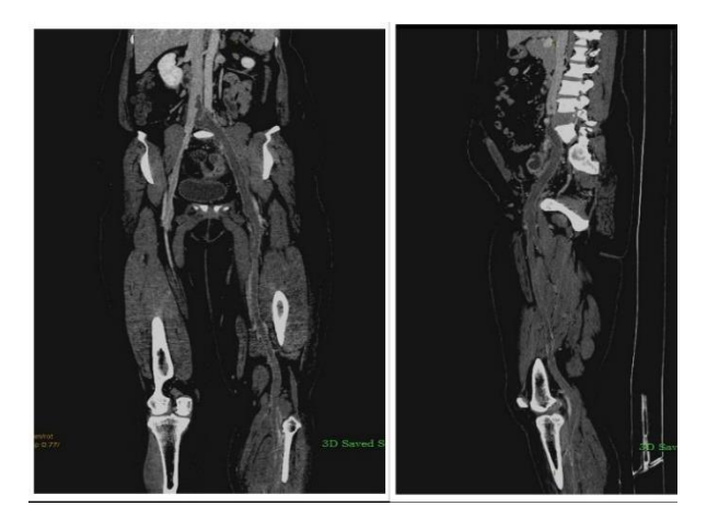
Figure 1: CT venogram-thrombus extending from IVC bifurcation involving left common iliac, external iliac, left femoral vein, popliteal vein and calf vein.

lumbar vertebrae. With these findings the diagnosis of MTS was made (Figure 1 and 2).