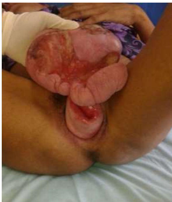
Figure 2: A large infected ulcer on the prolapsed fibroid.

Inferior surface of mass had a large ulcer which was necrotic and malodorous (Figure 2).