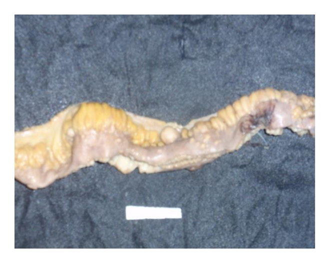
Figure 2: Removed part of the intestine involved by leiomyomatosis.

Final histopathology report from multiple sites also showed similar pathology. Patient discharged on 10<sup>th</sup> post-operative day. Patient is on follow up since 2 years without any complaint.