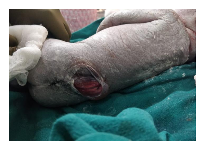
Figure 2: A terminated fetus with severe ventriculomegaly and associated neural tube defects.

ventriculomegaly in three of the fetuses could not be identified through ultrasound imaging (Table 1).