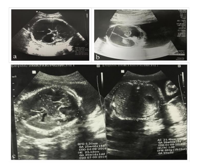
Figure 1: Ultrasonography findings of fetuses with mild (a), moderate (b), and severe (c) ventriculomegaly.