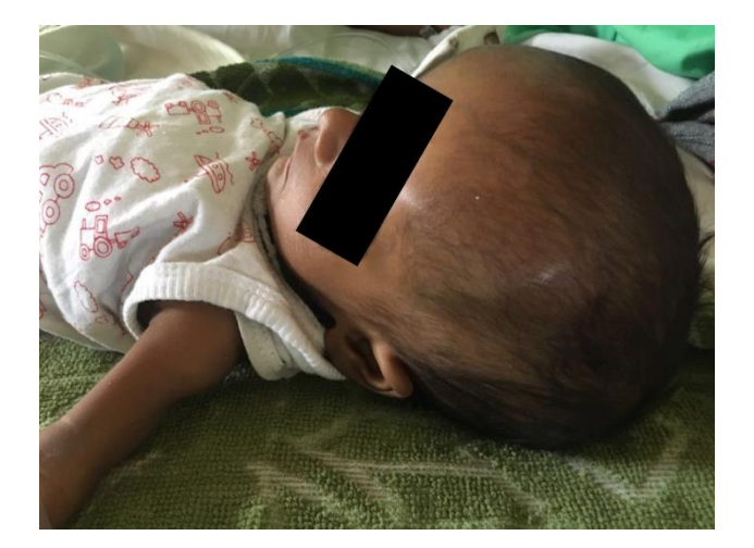
Figure 3: A continued fetus with moderate ventriculomegaly managed by a ventriculo-peritoneal shunt in the postnatal period.

The termination rate was high in the severely affected group (n = 3), as compared to the other groups. The surviving fetuses were delivered via vaginal delivery (n = 2) or cesarean section (n = 3). After 2 months of follow-up, it was observed that the surviving fetuses underwent a ventriculo-peritoneal shunt (n = 3) or are under close observation in the postnatal period without any adverse outcome (n = 2). All the mothers had a favourable outcome and survived (n = 10) (Table 3).