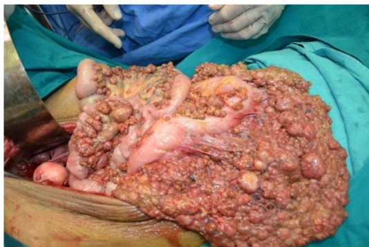
Figure 1: Per operative findings: ascites of about 2-2.5 litres, numerous tumor deposits were seen on bilateral hemi-diaphragm, mesentery of large and small intestine and omental caking was present.

On microscopic examination: bilateral ovaries showed a poorly differentiated carcinoma having a sinusoidal pattern with cells arranged in multilayered trabeculae with cells having vesicular round nucleus and prominent nucleoli the tumor has surface as well as intraparenchymal growth. On IHC: the tumor cells express CK8/18, CK and AFP, Heppar-1, and Glypican-3, the tumor cells were negative for SALL-4, EMA, PAX-8, CK20 and CK19. Intra-operative and post-operative period was uneventful. After surgery she received 3 cycles adjuvant chemotherapy. The patient is on continuous follow up till date with no recurrence.