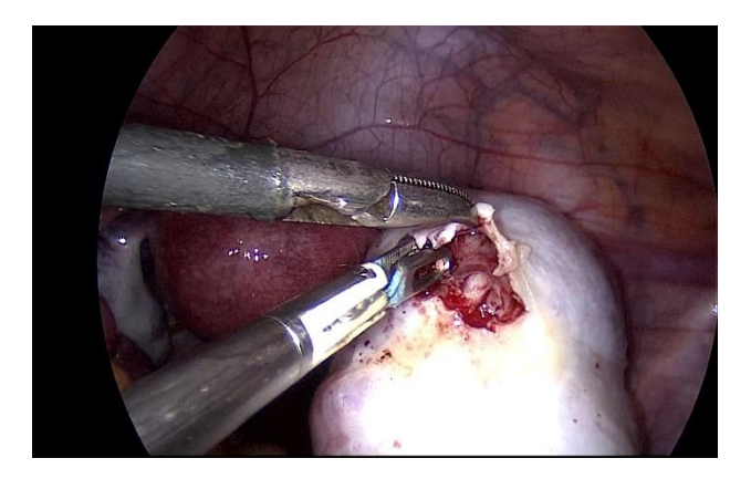
Figure 1: Excision of the right dermoid cyst.

peeled off and the cyst removed en-mass (Figure 1 and 2).