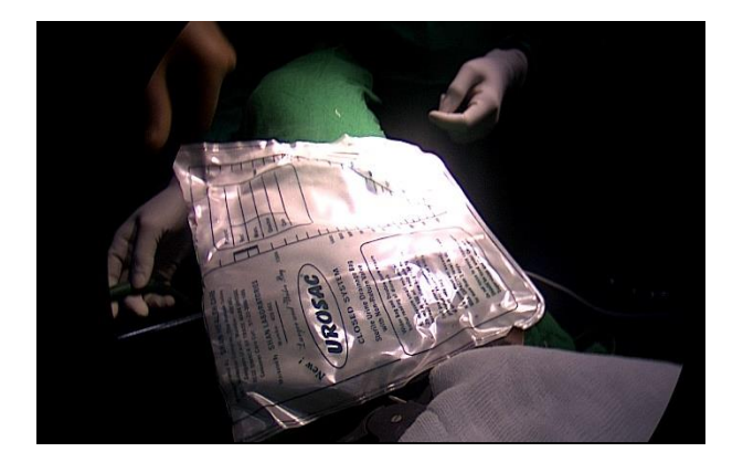
Figure 3: Insertion of the suction cannula into the urine collection bag (urobag).

However, often the glove may give way during cyst retrieval leading to intraperitoneal spillage of the cyst contents.