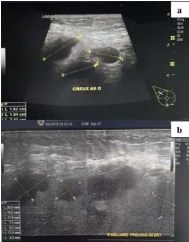
Figure 2: Ultrasound imaging of right axillary hollow and it's extension of lymphadenopathy.