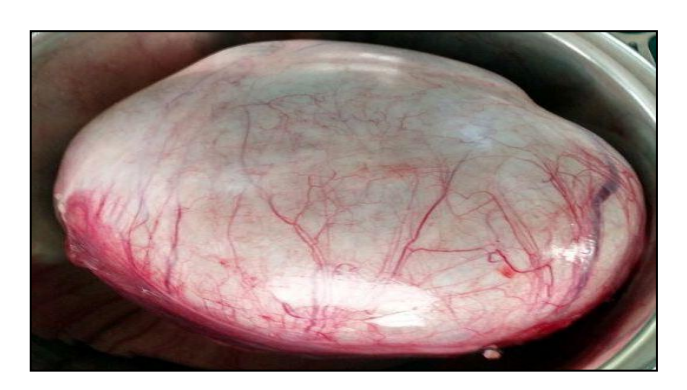
Figure 4: Excised Specimen.

The left ovary was normal in size and shape for the age. The child underwent right salphingo-oophrectomy. Rest of the abdomen was normal. The child was started on feeds on post-operative day 2. Postoperative recovery was uneventful and child was discharged on post-operative day 5. Histopathology was suggestive of mucinous cystadenoma of right ovary. Child is on regular follow up since 1 year and recent follow up scan done one year after surgery shows normal left ovary.