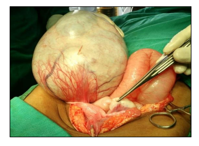
Figure 3: Intra operative picture.

Child underwent laparotomy. The entire abdomen was filled with a smooth walled cystic mass. The right ovary was completely replaced by the mass (Figure 3).