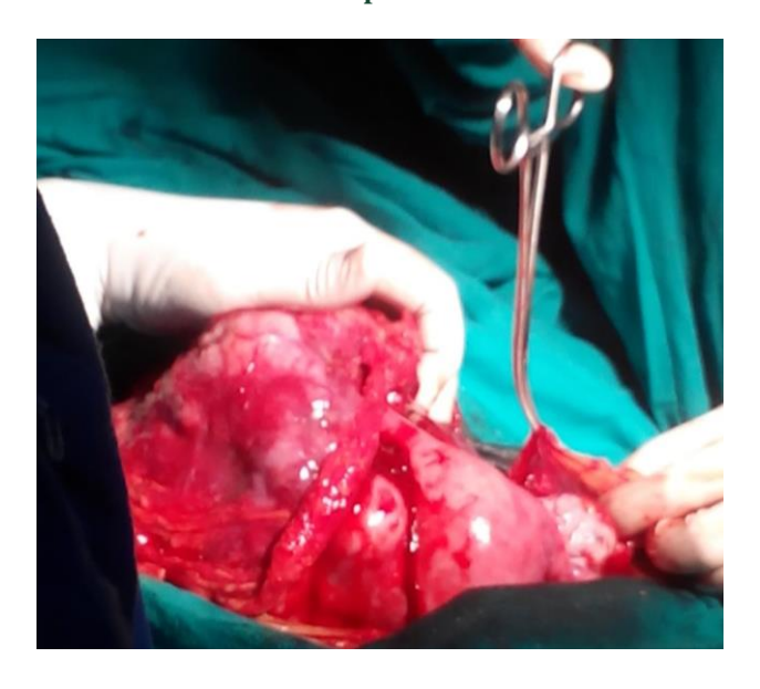
Figure 3: Intraoperative findings showing uterus with massive right sided adnexal mass.