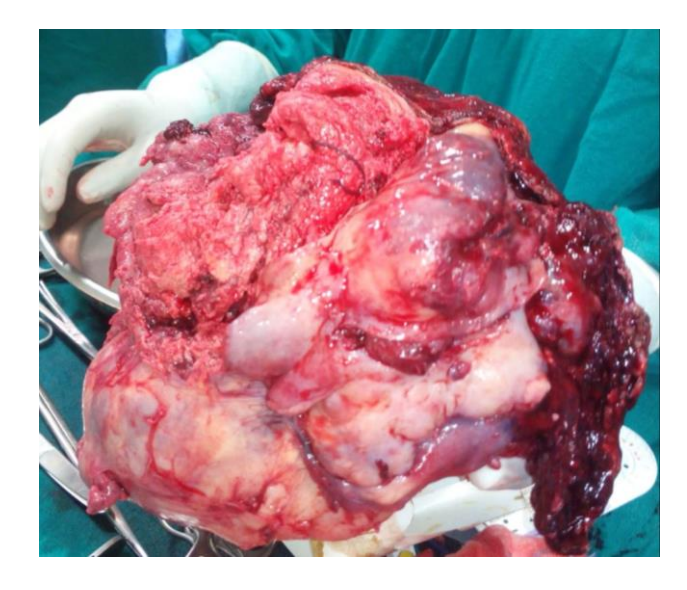
Figure 4: Gross specimen of ovarian tumor after debulking.