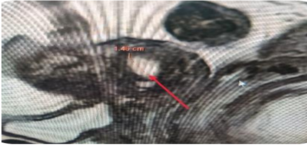
Figure 1: Gestational sac 1.5×2 cm in endocervical canal.

reaction. Yolk sac present and fetal pole with CRL 20 mm corresponding to 5 weeks of pregnancy Fetal cardiac activity was present. On colour doppler minimum flow seen in trophoblastic rim. Both ovaries and adenexa were normal. The patient was referred to our institute for further management of cervical pregnancy. Patient was married for 14 years. She had a missed abortion of 8 weeks gestation 6 years back when she had taken ovulation induction agents. She had undergone D and C for the same. Diagnostic laparoscopy was done in 2013 in which, uterus was normal, left fallopian tube was blocked and Rt tube delayed spill was present.