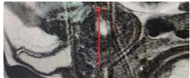
Figure 4: Cervical length 3.7 cm. Gestational sac completely within cervical canal.

As the patient desired future fertility, conservative management with standard multidose protocol of methotrexate 1 mg/kg intramuscular was given on day 1,3,5, and 7 with 0.1 mg/kg of Leucovorin IM on day 2,4,6 and 8. Her CBC was repeated before each Methotrexate injection. Serum \beta hCG was done on day 1,3,5,7 and 11 which showed decreasing trend. Further serum \beta hCG was followed weekly till complete resolution which was 12 mIU/ml on day 56 after methotrexate injection. Simultaneously patient was followed up with TVS which showed Mean sac diameter of 2 cm with fetal pole and cardiac activity on day 1 which was reduced to Mean sac diameter of 0.5 cm with no fetal pole on day 11.