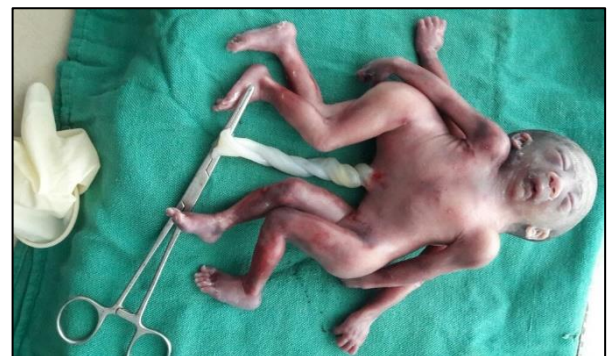
Figure 6: Conjoined twins with only two nipples.