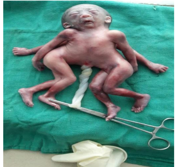
Figure 4: Craniopagus; fused at skull, thorax, abdomen, four upper limbs and four lower limbs with a single face; note single umbilical cord.