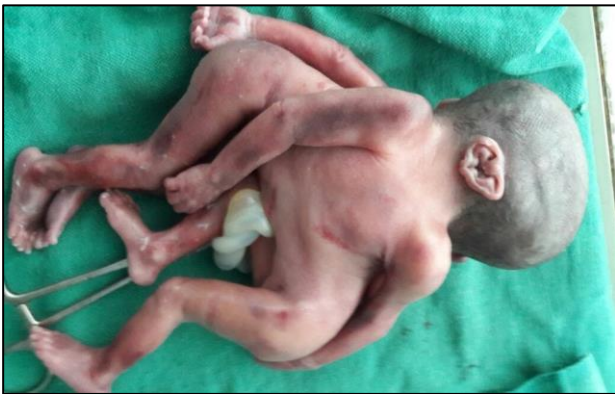
Figure 2: Posterior view of head showing two occipital protuberances.