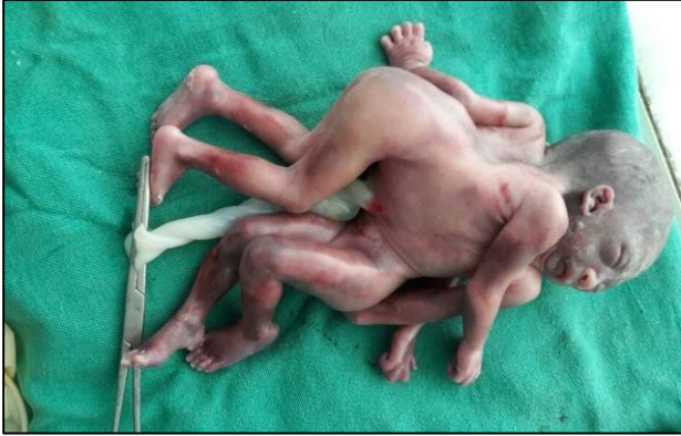
Figure 1: Lateral view of conjoined twins, still born at birth.

facilities. She was in advanced labour with good uterine contractions, approximately 60% effaced, 6-7 cm dilated, membranes were present and bulging and was augmented with oxytocin. She delivered still born male conjoined twins with assisted cephalic delivery uneventfully (Figure 1-6). Placenta and membranes were delivered in toto and her postpartum period was uneventful.