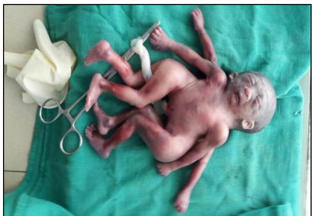
Figure 3: Anterior view conjoined twins, cephalopagus-non janiceps.