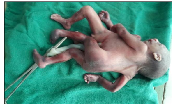
Figure 5: Note sex of the twins (male).