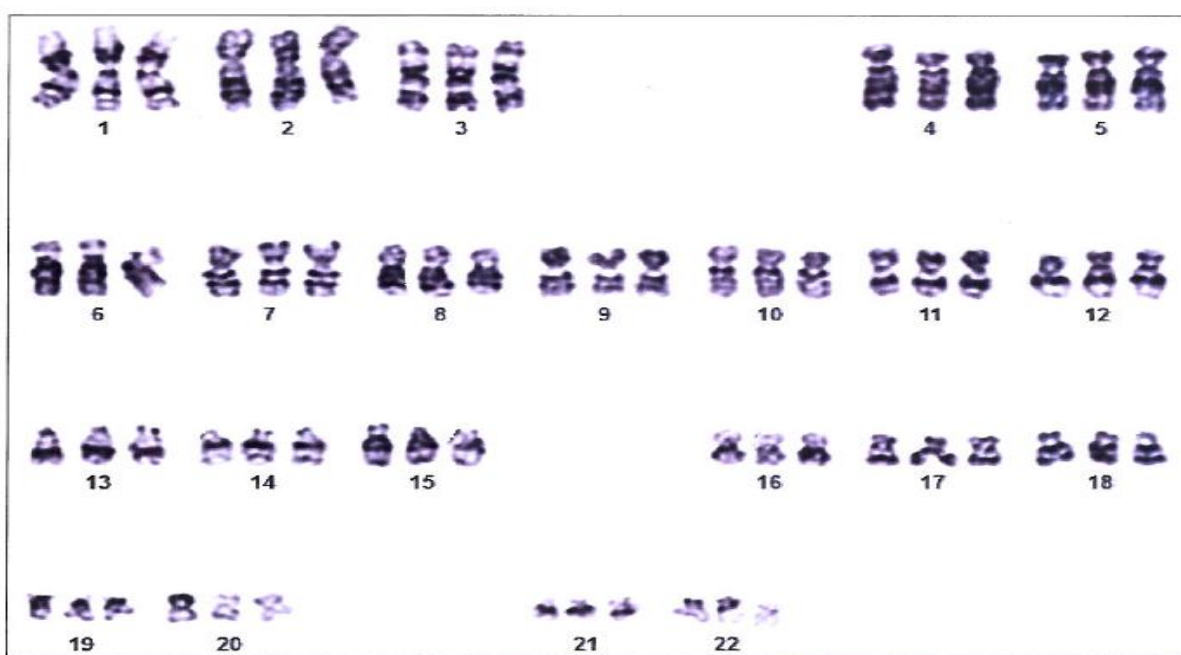
Figure 1: Amniotic cell culture metaphase karyotype: 'G' banding.

karyotype revealed a presence of extra set of chromosomes (69) in all the analysed cells. Hence the case was reported by our Medical Geneticist as Triploidy syndrome. The patient was also recommended for Genetic Counselling and aslo parental blood karyotype was done to see any cytogenetic abnormality or variations. Husband's karyotype showed 44, XY that is apparently normal karyotype while wife had shown 44, XX; 15ps+ (Slightly increase in the length of satellite on one of the chromosome 15). Meanwhile at 19-19.5 weeks the patient had a miscarriage and after Medical Termination of Pregnancy (MTP) for academic purpose the Abortus material (POC) sample was asked for Cytogenetic (FISH) and Histopathology studies. FISH studies with POC specimen revealed Trisomy status for chromosomes 13, 18, 21 and presence of extra Sex chromosome (XXY) in all cells analysed.