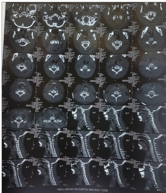
Figure 2: CT neck of the patient.