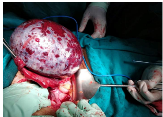
Figure 2: Intraoperative image after delivering the mass.

The patient underwent Staging laparotomy under GA supported by epidural analgesia. A low midline incision was given which was later extended supraumbilically. The uterus was of normal size.