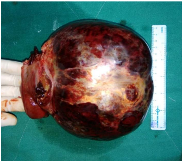
Figure 3: Gross specimen with scale.

While delivering the cyst, a small amount of mucinous fluid was drained out of it. The mass had solid areas with interspersed cystic areas filled with mucinous fluid and a few hemorrhages (Figure 3). Hence, suspecting malignancy, infracolicomentectomy and lymph node dissection was carried out along with multiple peritoneal biopsies and appendectomy. Later, the histopathological report confirmed it to be mucinous cystadenofibroma, following which, the patient was discharged on 5th post-operative day in a stable condition. The patient did not require any additional treatment beyond regular checkups.