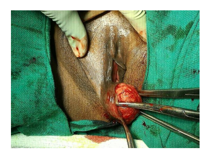
Figure 1: Intraoperative appearance of Vulval leiomyoma.