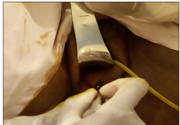
Figure 2: Vaginal incision at the level of nympho-hymeneal Junction.

A bladder catheter was set up allowing the evacuation of about 450cc of urine for thrombus evacuation under general anesthesia was performed in the operating room. The incision was made at the level of nympho-hymeneal junction (Figure 2) and more than 250 ml of blood with thrombotic and purulent debris was externalized (Figure 3). Abundant and cleansing with physiological saline and polyvidone and Delbet drain placement were performed for 48 hours (Figure 4). A packing was left in the vagina with compressive wound dressing for 24 hours.