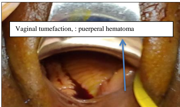
Figure 1: Vaginal examination.

This is a 26-year-old patient with a history of chronic hypertension whose pregnancy has been well followed. Labor was induced by misoprostol. The delivery was uneventful at 37 weeks vaginally after 7 hours of labour and gives birth of a 2200 g fetus in meconium amniotic fluid. The fetal presentation was cephalic. there was no instrumental extraction or episiotomy. There was no immediate postpartum hemorrhage, hematoma, or traumatic injury, and the uterus was well retracted. The postpartum period was uneventful and the patient was discharged two days later. Ten days after delivery, she returned to the obstetrical emergency service for acute urine retention for 12 hours, tenesm, vaginal pain and dysuria. She also complained constipation evolving for 5 days. Everything was evolving in a feverish context. At the admission, there was a cutaneous pallor, a blood pressure at 140/80 mmHg, a heart rate at 90/min, a respiratory rate at 23 / min and a temperature of 38°C. On physical examination, we found a bladder globe with apparently normal and symmetrical vulva. The examination with the vaginal speculum showed a tumefaction of six centimeters on the left lateral side of the vagina (Figure 1) which was sensitive and hard to the vaginal touch. In the rectal examination, a painful tumefaction was seen on the lateral wall of the rectum with an empty rectal touch. There was no defense and rebound during abdominal examinations. The rest of the exam was normal.