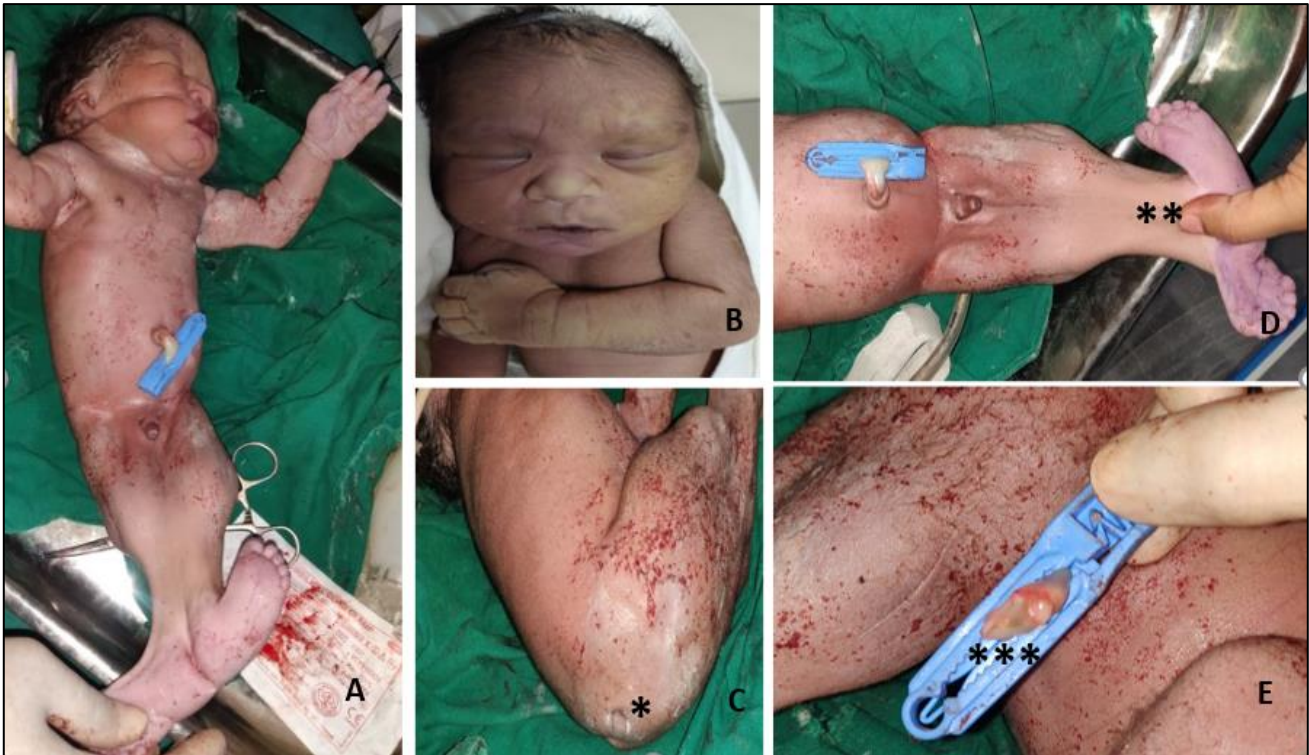
Figure 1: (A) Gross morphology (B) Potter's facies (C) Anal dimple (*) (D) Merged lower limbs-mermaid tail (**). (E) Umbilical cord (***) (2 Umbilical arteries + 1 Umbilical vein).

common was a consistently low AFI (1-2) with no fetal malformations reported.