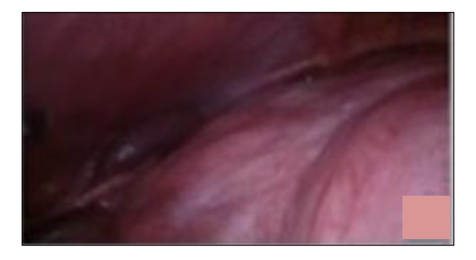
Figure 2: Laparoscopic finding showing large uterine mass filling the whole abdominal cavity.

The large myoma was extending up to hepatic surface displacing small intestinal loops and pancreas superiorly, retroperitoneal structures posteriorly and urinary bladder anteriorly. Her past medical and gynecological history was unremarkable.