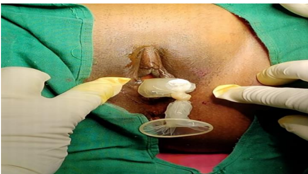
Figure 5: Vaginal mould kept in situ to prevent refusion.