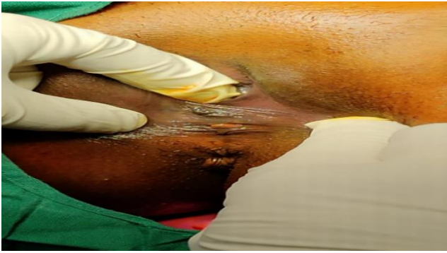
Figure 2: Index finger in the pouch formed by labial septum.