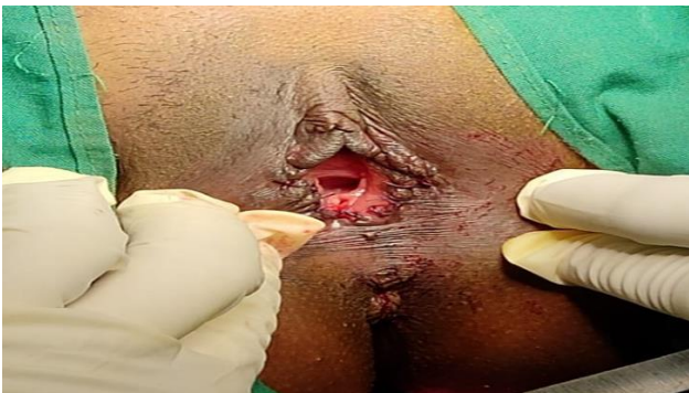
Figure 4: Edges of the incision repaired by vicryl 2/0.