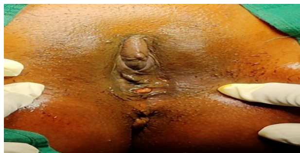
Figure 1: Labial adhesion with area of healed left mediolateral episiotomy.

septum with an opening on anterior fourchette in close relation with urethra. Vagina and cervix were not visualised (Figure 1). There was a septum that has formed the pouch admitting about 2-3 cm of the examining finger (Figure 2). Haematological investigations and pelvic ultrasound were within normal limit. No evidence of hematometra or hematocolpos. Patient was counselled on her diagnosis. Consented to examination and repair under anaesthesia. Surgeon had done a sharp dissection of the pouch (Figure 4) and edges of the incision were repaired using vicryl 2/0 (Figure 5), separated using a wax mould (Figure 6). She did well subsequently and was discharged on post-operative day 3. She was followed up for next 6 months with no further complaints.