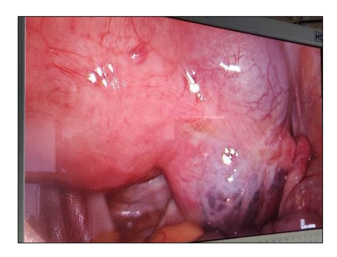
Figure 1: Pseudo-ruptured interstitial ectopic.

No subsequent uterine bleeding was noted. The patient was discharged on 8th postoperative day after an uneventful recovery.