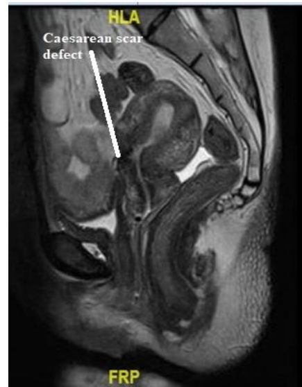
Figure 1: MRI pelvis (contrast)- retroverted uterus with a focal semicircular disruption of the ventral myometrium at the LSCS scar site extending through the serosa with tethering of the endometrium towards the scar site.

rupture. Few GER hypointensities are noted in the scar site suggestive of old blood clots (Figure 1).